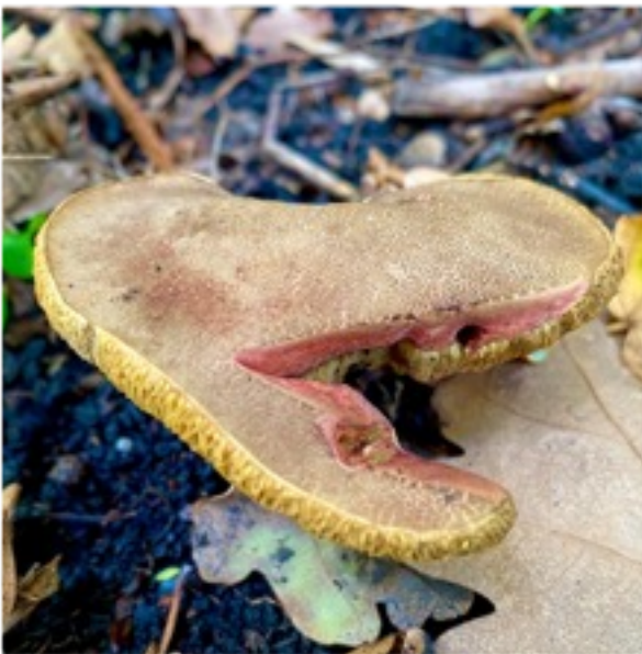
Red cracking bolete mushroom 2022