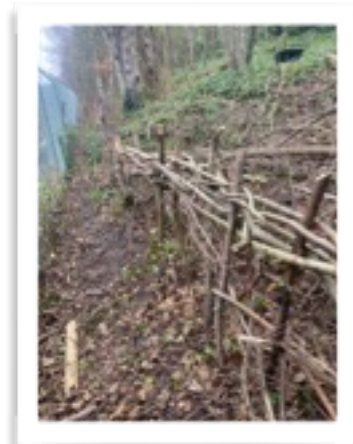
Hedgehog release and new hedge row project 2022