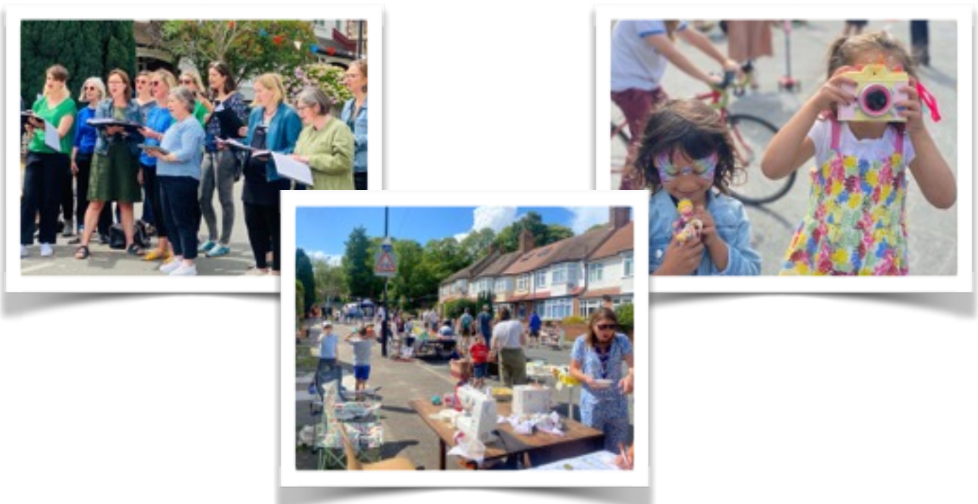
Nunhead Community Choir and community enjoying the 100 Year celebration 2022