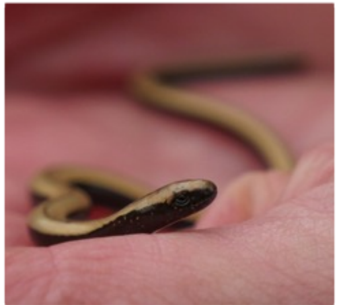
Juvenile slow worm 2022