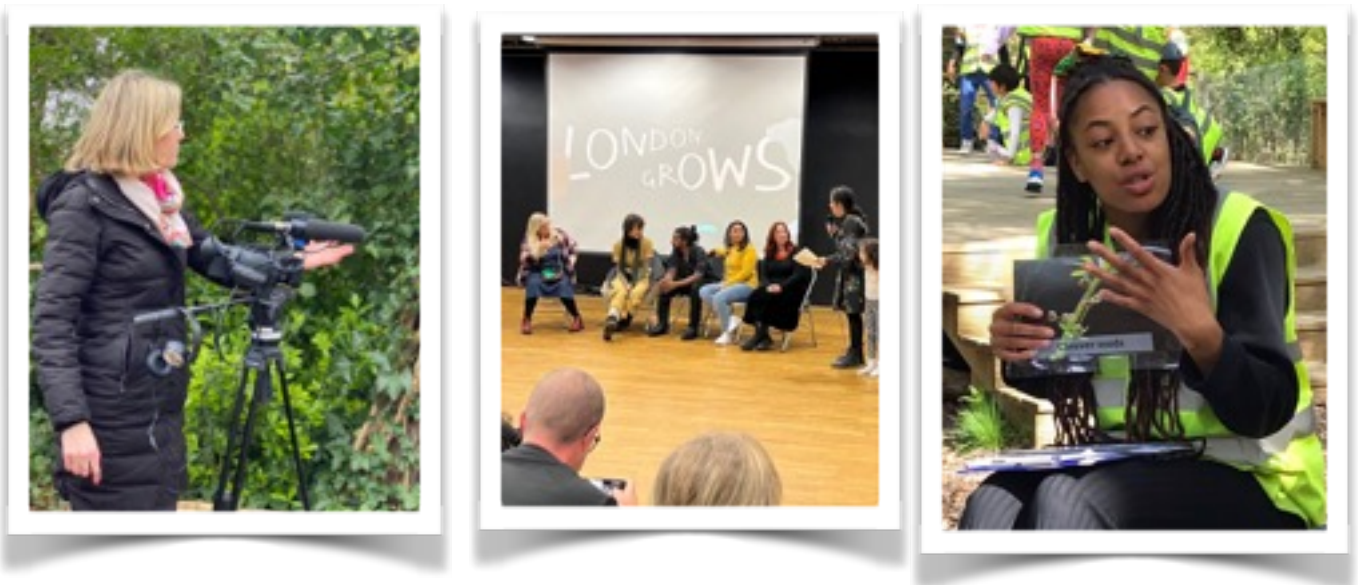
ITV News coverage, London Grows screening and Great North Wood project 2022