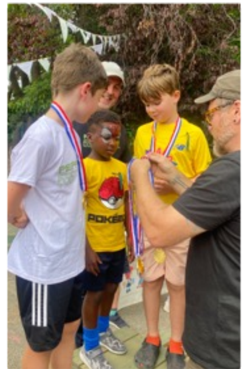
Peppermint 500 fundraising event 2023

The campaign was successful and the funds were raised ready to begin the acquisition process in 2023. The charity was voted Community Heroes by Lewisham residents and we were asked to share success and advice to several other groups such as St.John's Society, Climate Action Lewisham, East London Lines, Campaign to Protect Rural England, campaign group protecting woodland in Tunbridge Wells and Trees for Democracy campaign group.