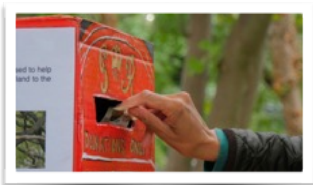
Green Jam Open Day 2022